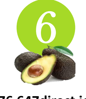
276 647direct jobs