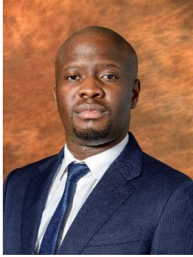
Zuko Godlimpi, MP

Deputy Minister of Trade, Industry and Competition