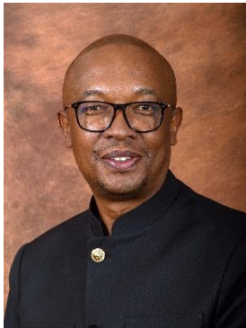
Parks Tau, MP

Minister of Trade Industry and Competition