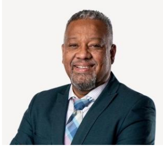
Adv Rory Voller, Adv CIPC Commissioner

I present the 2025/26 CIPC Annual Performance Plan (APP) that continues to give effect to the CIPC's mandate as derived from the Companies Act, 2008 (as amended) and its strategic alignment with the Department of Trade, Industry, and Competition ( the dtic ). This APP highlights our sustained focus on driving inclusive economic growth, improving ease of doing business, and protecting intellectual property, all while contributing to South Africa's broader development goals as outlined in the Government of National Unity (GNU) and the Medium-Term Development Plan (MTDP) 2024-2029.