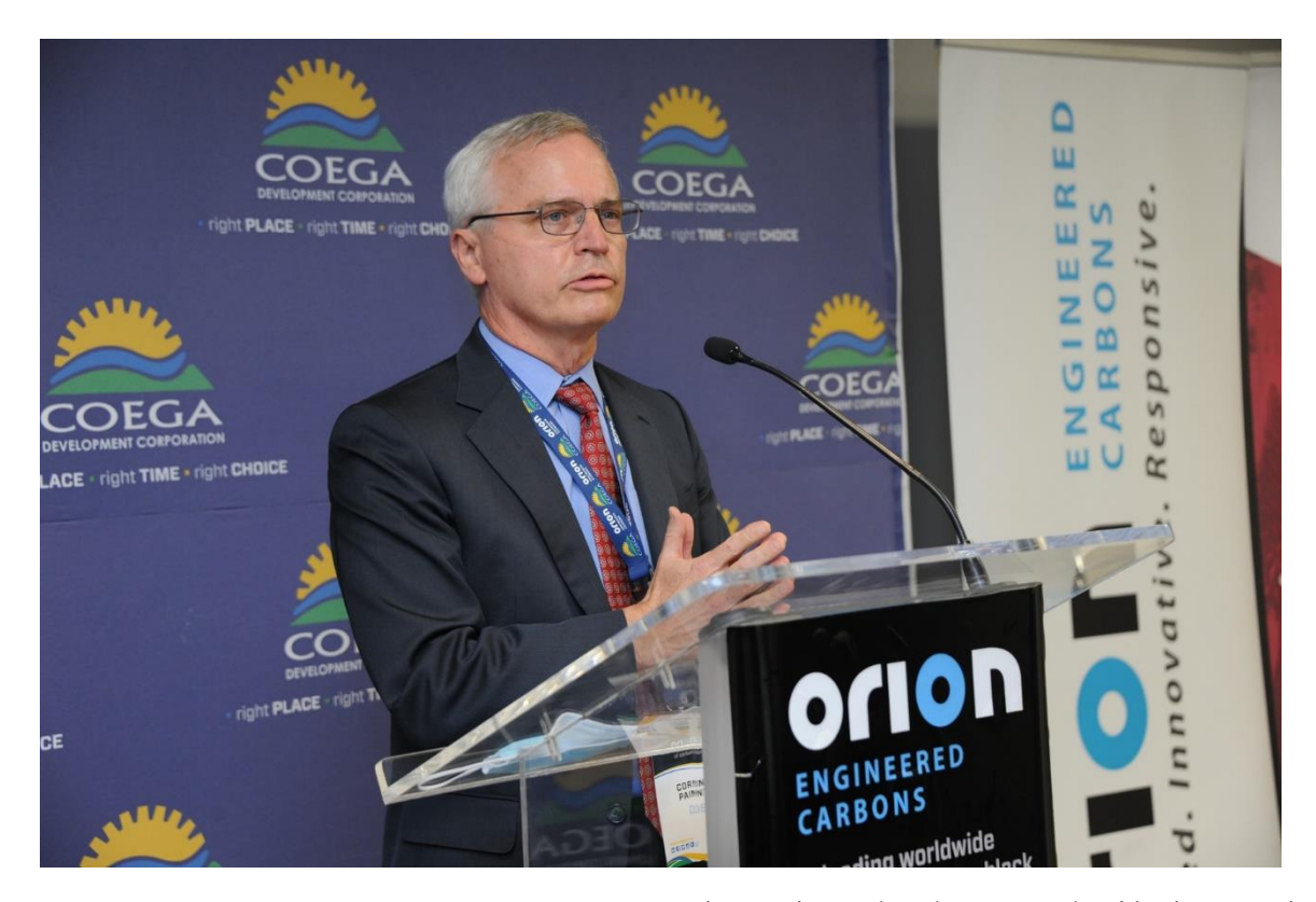
PATHING THE WAY FORWARD: OEC Group CEO, Orion Engineered Carbons – South Africa increases its export to the European markets.