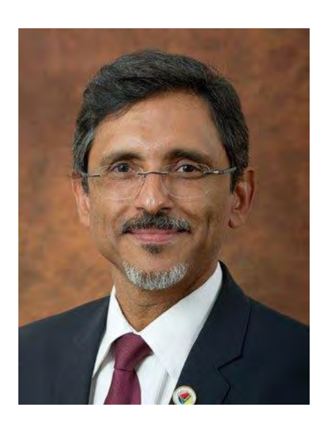
Mr Ebrahim Patel - Minister of Trade, Industry and Competition

The Revised Annual Performance Plan 2020/21, is hereby submitted in accordance with the Revised Framework on Strategic and Annual Performance Plans.