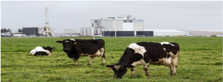
Primary agriculture products