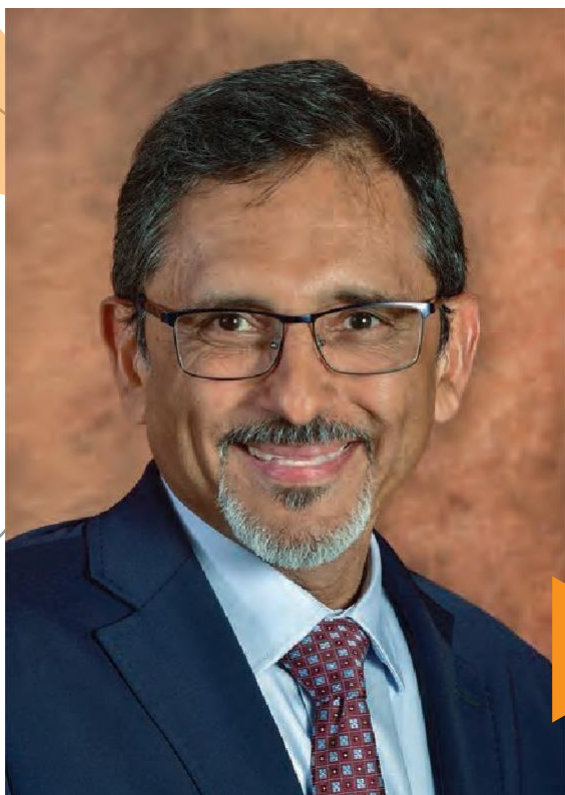
Mr Ebrahim Patel

Minister of Trade, Industry and Competition