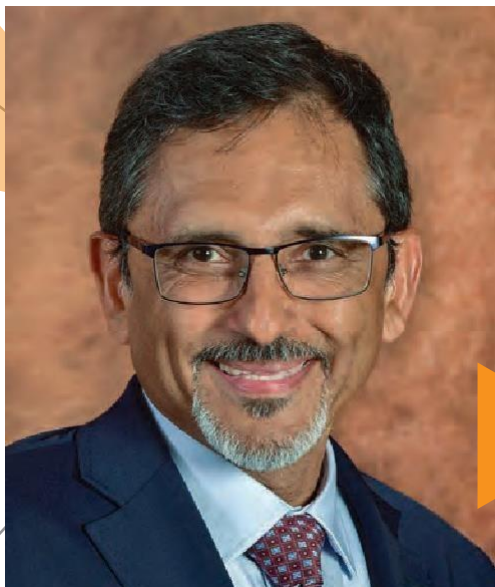
Mr Ebrahim Patel

Minister of Trade, Industry and Competition