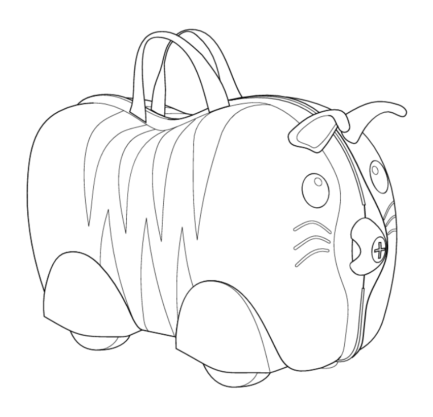
FIGURE 2 – THE ALLEGEDLY INFRINGING DESIGN