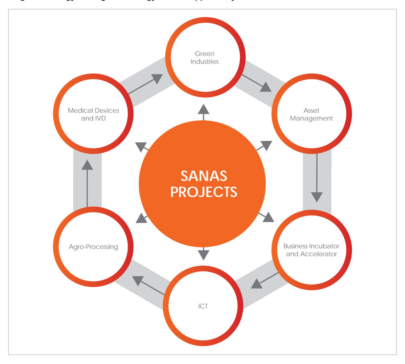
Diagram 3: Energy and High-Technology Sectors Supported by SANAS Accreditation